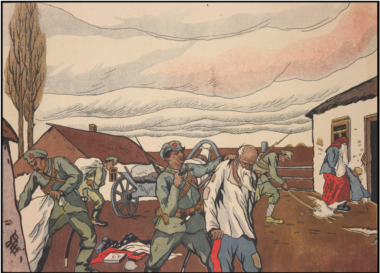
A poster published by the Whites during the Civil War showing members of the Red Guard requisitioning food from peasants.

A Russian officer reporting back to the Provisional Government, 1917.